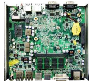
» Fanless Design