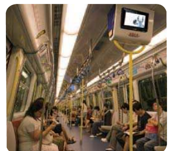
Multimedia / Digital Signage