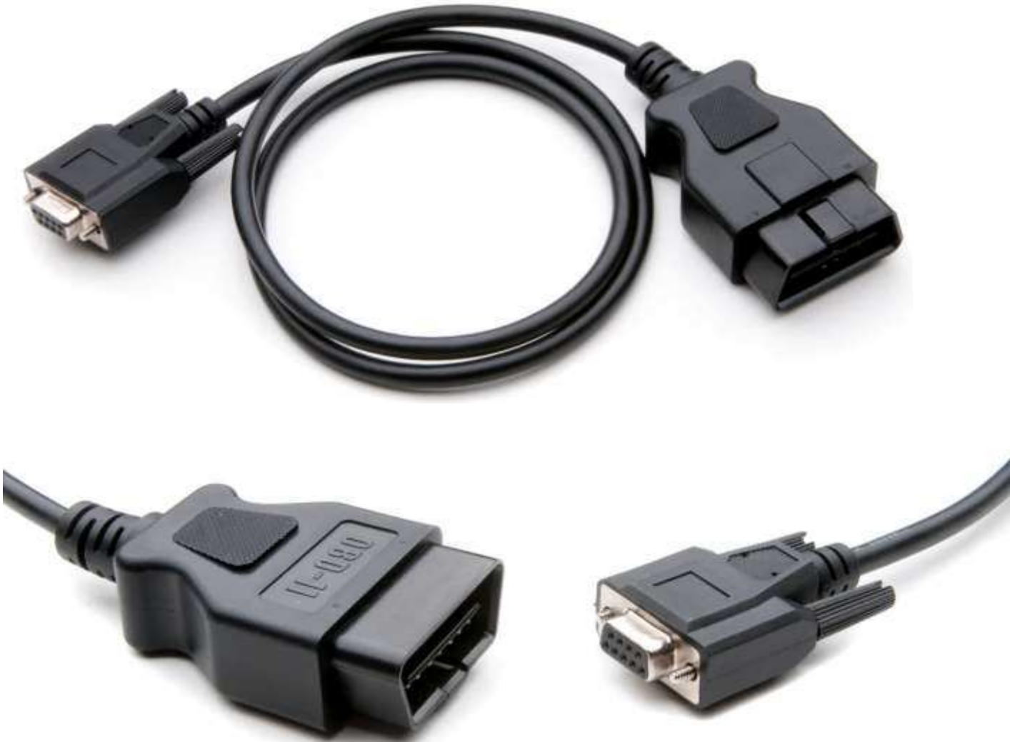
Figure 1-1 OBD-M-DB9-F-ES

The DB9 to OBD-II adapter cable is a simple adapter to allow the EasySYNC range of CANbus products to mate to OBD-II interface connectors commonly used in automotive diagnostics. The DB9 end plugs directly into the EasySYNC CANPlus modules or any CANbus adapter that conforms to the CAN-in-Automation (CiA) DS102-2 pin-out. The OBD-II end plugs directly into an automotive diagnostic port. The cable functions only with the CANbus portion of the OBD-II specification.