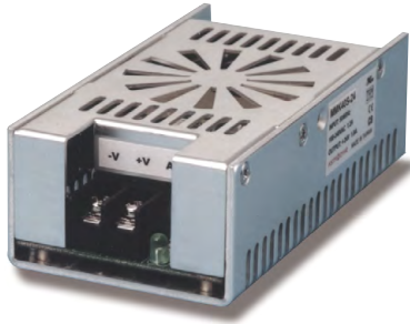
2.5"W x 4.75"L x 1.5"H