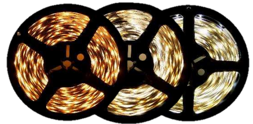
Warm White 3000K Pure White 4200K Cool White 6000K

Inspired LED Flexible Strip Lights are a simple, customizable solution for all of your LED lighting needs. These unique strips can be cut to length and terminated with solderless end connectors for easy DIY installation. Energy efficient, with a wide range of options for brightness and color, LED Flex Strips are the perfect option for any lighting application.