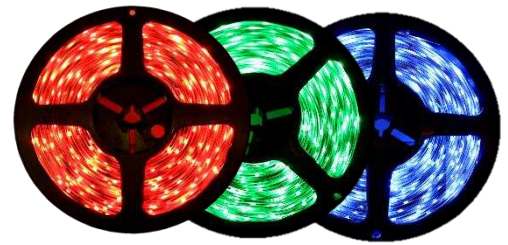
Red Green Blue

Available in NB & SB Only NB, SB & UB Only