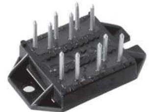
Pin arrangement see outlines