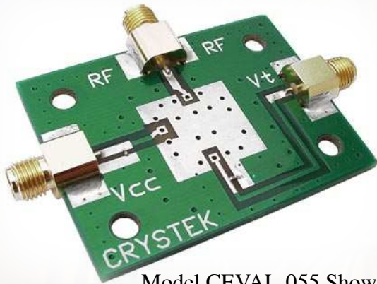
Model CEVAL-055 Shown