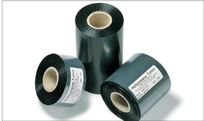
Ribbons - TTRA, TTRC+.

The range of ribbons has been designed to give maximum print clarity and performance. Material can be handled immediately after printing, enabling the printed tubing to be immediately applied without a secondary mark stabilising operation.