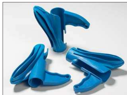
Applicator tools HAT are available for every Helawrap cover size.

The new Helawrap applicator tool enables the user to bundle cable rapidly and effortlessly. The applicator tool has been optimised to glide smoothly through the cover and allows easy insertion of cable into Helawrap. The unique design also allows individual cables to be removed from the applicator tool and branched off through the cover apertures. A tool is included with every Helawrap package. Additional tools can be purchased separately.