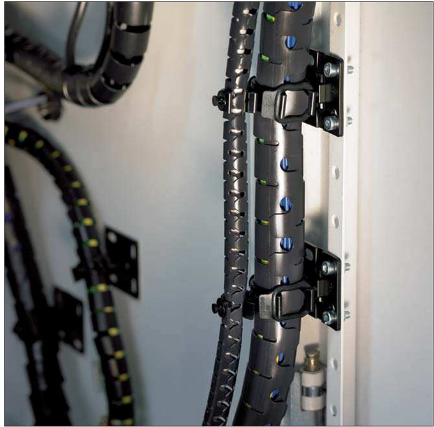
Protecting and fixing cables with the Helawrap cable cover and accessory set, for instance in wiring cabinets.