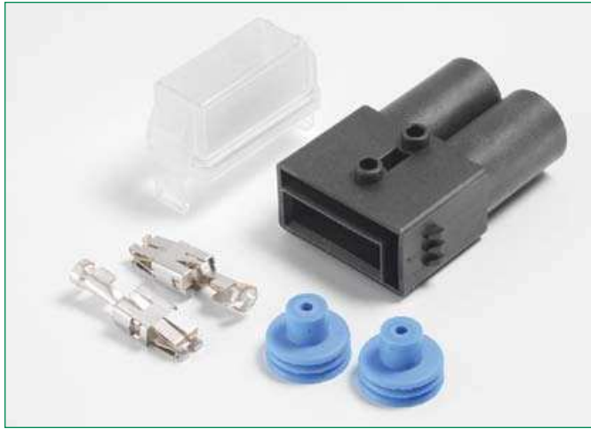
Dimensions in mm / Maße in mm